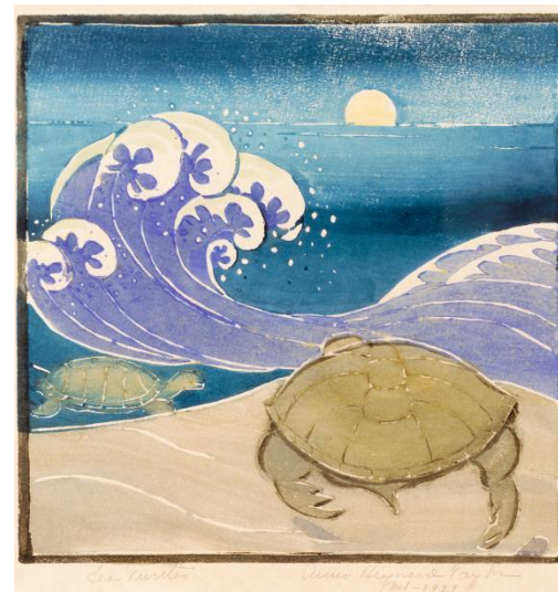
Prints and Drawings